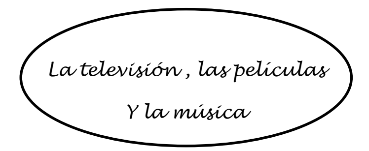
Task 3 – Revise connective phrases – how many of these do you remember from AVOCADO?